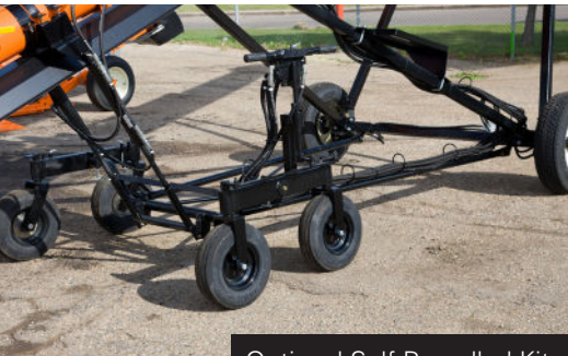
Optional Self-Propelled Kit