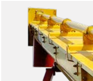
Solid Tube Guard

Complete with all-wheel drive, standard hydraulic steering, and rugged all-terrain tires capable of handling tough terrain, this compact mover kit gives better access to large diameter hopper bins and a sharper turning radius.