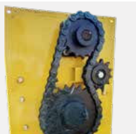
Adjustable Chain Tensioner