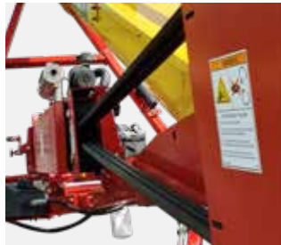
Triple Banded Belts